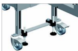
Fixable feet With adjustable feet the machine can be securely located