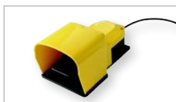
Foot switch with protection cover