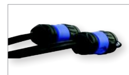
Interface for integration into existing production lines