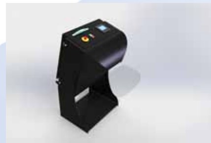
Easy to use for simple operation and maximum functionality. Adjustments for the number of wraps, wrap pattern, film tension, overlap, overwrap, and up/down speed are standard.