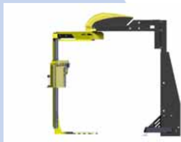
The rotating arm can be easily adjusted to achieve a wrapping diagonal of 1800 mm or 2200 mm ; offering extreme versatility at no additional cost.

Four individual wrap programs can be stored using the touch screen HMI for simple operation of the machine. The programs include eight functions which can be adjusted to meet the demands of the most challenging applications.